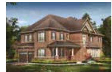
3100 SQ FT -ELEV A