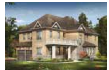
3100 SQ FT -ELEV B